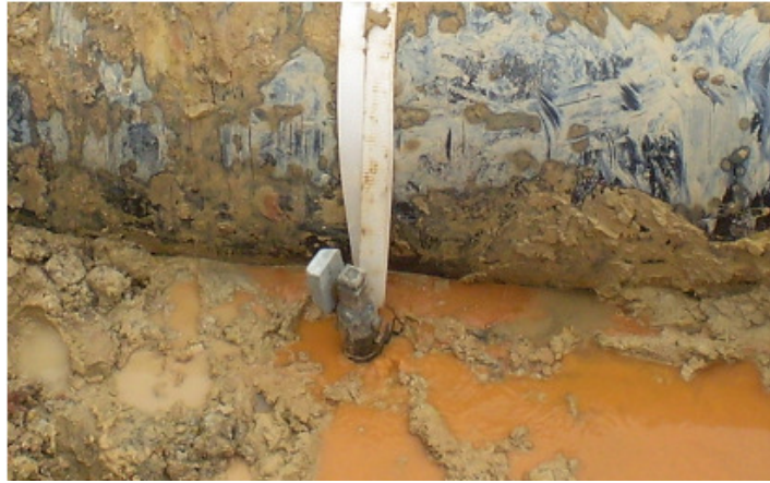
Sacrificial anode and polyester belt details

To the end of the installation sacrificial anodes are coupled, working as a cathode protection, avoiding the corrosion of ferrous material that is present in the alloy of the system components.