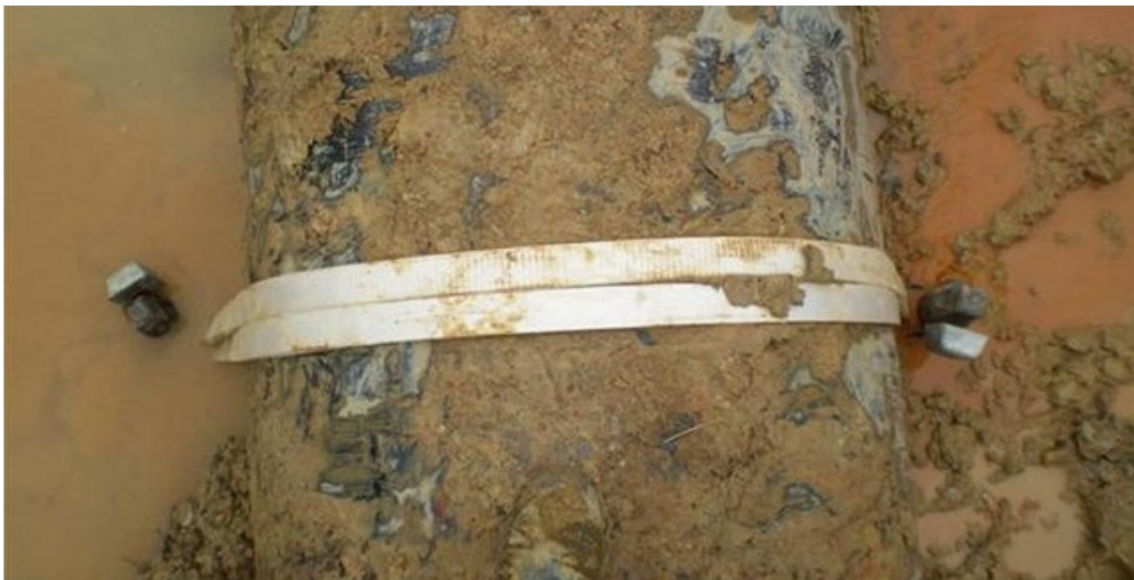
Installed Anchor System