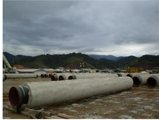
Concreted duct storage

Moreover, when compared with concrete, the anchor system presents prices lower than 50%.