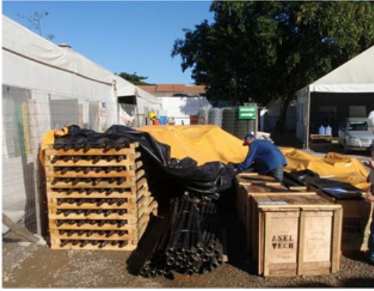
Anchor System Storage