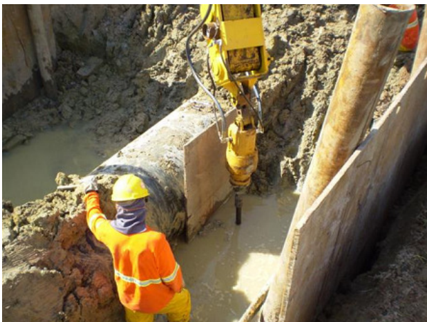
Worker monitoring at distance

An important point to be considered is the risk of accidents. The concreted tubes can weigh more than 16 tons, being an imminent risk, whereas the components of the developed system weigh only 30 kg, which makes the handling easy. Moreover, only in the beginning of the installation a worker is necessary to position the anchor, the remaining process can be accompanied by distance, eliminating the risk of accidents.