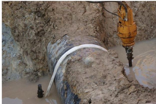
Anchor System installation using a hydraulic chuck

Another advantage is the easiness of installation of the anchor system. The necessary equipment is restricted to a digger where there is a hydraulic chuck coupled and a differential manometer. The necessary labor for installation is also reduced, three workers are sufficient to carry out the installation.